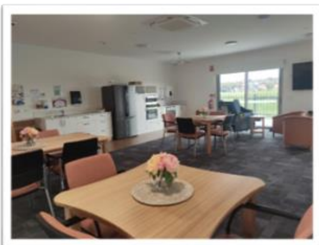
Park Lane Dining Area